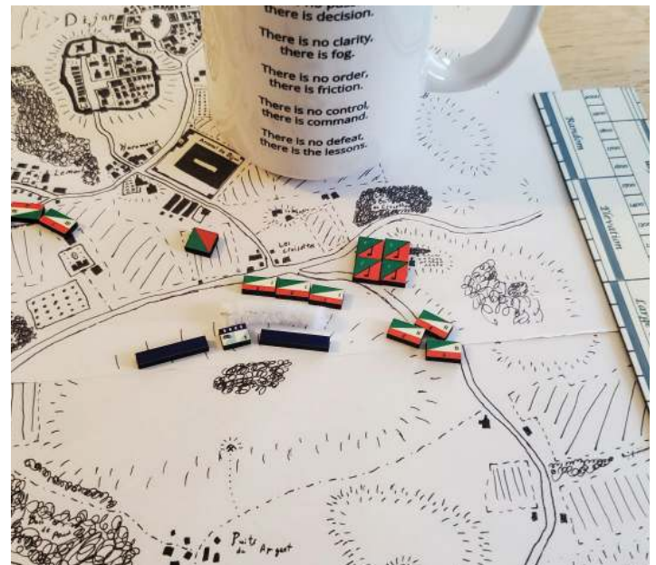
Physical Kriegsspiel pieces and a hand drawn map.

towards the overall goal. A game of Kriegsspiel is all about making mistakes in a safe environment. Every game ends with an after-action-debriefing and discussion to reflect and improve. The experience is tense, unlike any other game.