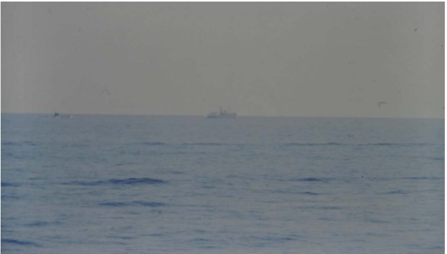
Soviet sub and Soviet tender.

I was a 19yr old sailor in the US Navy and serving aboard USS Buchanan (DDG-14). It was November 1973 and the USS Oriskany (CVA-34) Task Force (aircraft carrier and support ships) to which we were attached was pulled off Yankee Station (in the Gulf of Tonkin offshore North Vietnam) to relieve the first task force of USS Hancock (CVA-19) that was sent to the Gulf of Oman following the Yom Kippur War. We were at sea for a couple of weeks after departing our overseas homeport of Subic Bay, P.I., and were all pretty much bored stiff. Even the novelty of transiting through the narrow and shallow Strait of Malacca that forced several(!) shadowing Soviet submarines to surface (sailing with their tenders) lost its appeal after the first few of them.