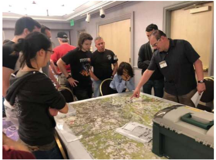
After-Action-Debrief at an in-person convention in Los Angeles.

Since then, the IKS has constantly grown to over 1,700 members, it has established a Master Umpire curriculum to ensure quality of representative games and is encouraging and supporting enthusiastic hobbyists, serious wargamers and designers alike